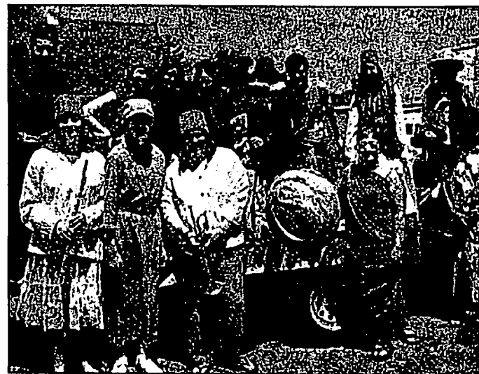
Duxbury Free Library's "Bookmarks Club" took home second place in the maxi-floats division with their Indiana Jones recreation.